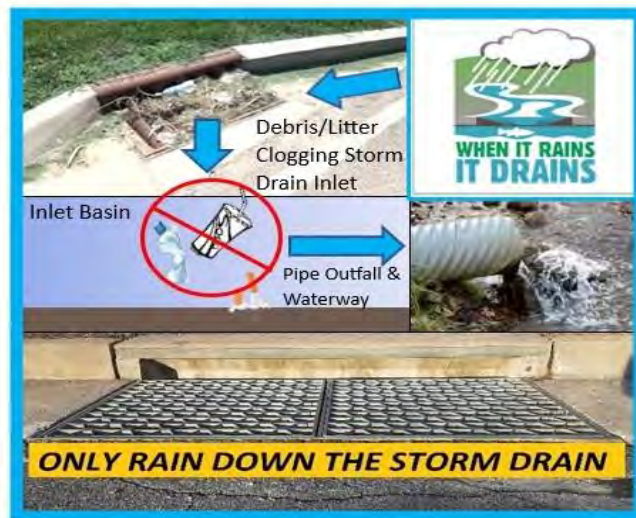
Storm drain inlets are often collection points where grass clippings, leaves and litter can cause flooding and convey materials to waterways. Be sure to keep clean of debris for stormwater flow!