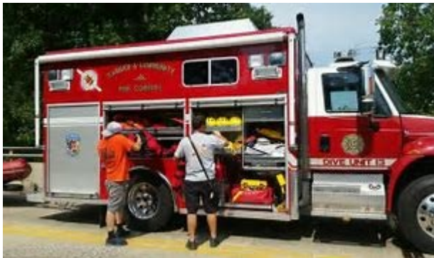
Housed and owned by Station 13