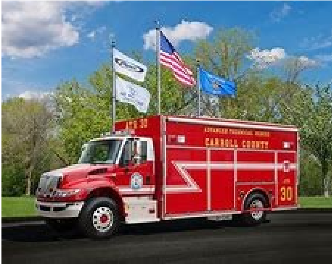
ATR 30 Housed at Station 6