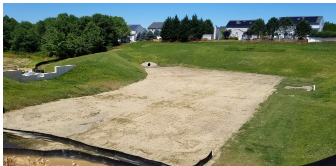
Woodsyde Stream Restoration