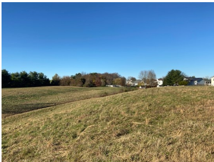
Commerce Center before planting:

Most of the Commerce Center Reforestation project was funded by the Department of Natural Resources Chesapeake & Coastal Service through a grant awarded to the County in the amount of $42,000. This project is to be planted in the late fall of 2021. Maintenance and inspections of the planting area will occur for a minimum of 3 years to ensure establishment of a successful planting.