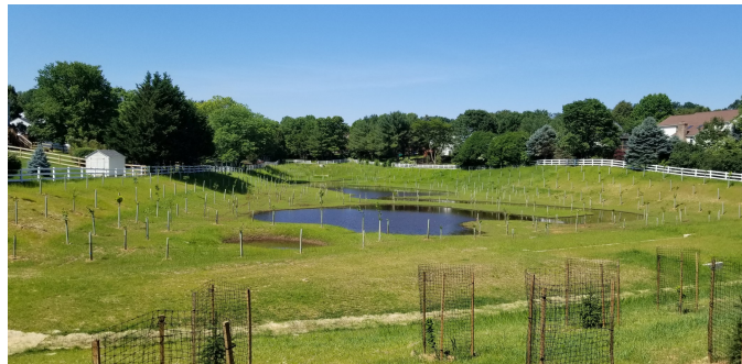
Woodsyde SWM Facility