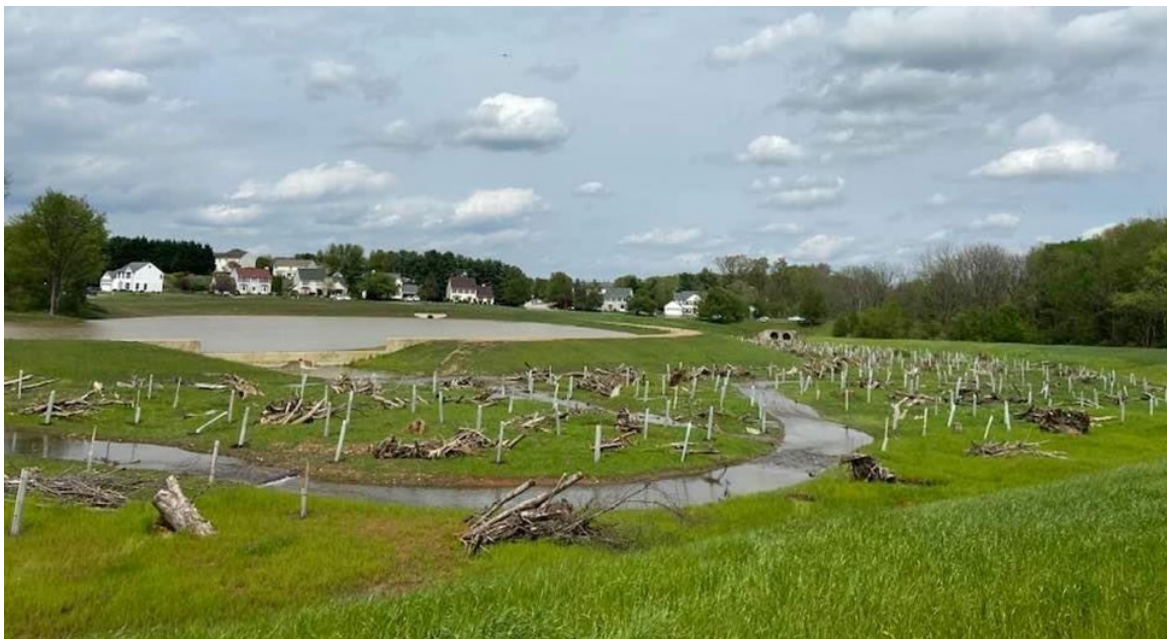
Willow Pond SWM Facility Retrofit & Stream Restoration

Grant funding for partial construction monies provided by: