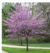
Red Bud (Eastern)