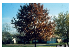
Northern Red Oak